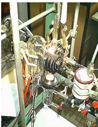
Fig. 1 : Experimental device developed at the LISA to study the photodegradation of molecules of cometary interest. S.E.M.A.PH.OR.E. comet experiment (Simulation Expérimentale et Modélisation Appliquées aux PHénomènes ORganiques dans l'Environnement cométaire – experimental simulation and modelling applied to organic phenomena in the cometary environment).

In the lab, the team has developed experimental devices to reproduce conditions similar to those found in the cometary nucleus when it approaches the Sun. They can thus study the products of the thermodegradation or the photodegradation of various solid organic molecules like POM. They compare the results obtained with the observations made on comets and try to determine, indirectly, the nature of the refractory material they contain.