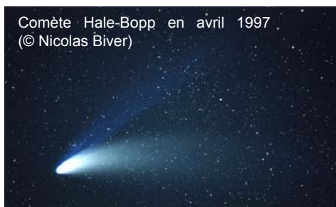
Comète Hale-Bopp en avril 1997

Comets are one of the most mysterious bodies in the Solar System. They are formed from a material contained in a molecular cloud that collapsed to give birth to our Sun and its trail of planets.